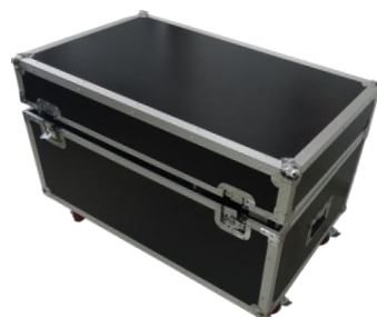
Carrying case (optional)