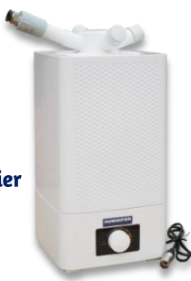
External Humidifier System